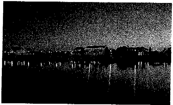
Near California Delta's Suisun City

Moseying on up Hwy 160, crossing a bridge and continuing north for a few more miles you'll come to the Ryde Hotel and Restaurant. The Ryde is a refurbished 1880's speakeasy and considered one of the upscale restaurants of this area. Sunday brunch is consistently good, as are all lunches and dinners. This